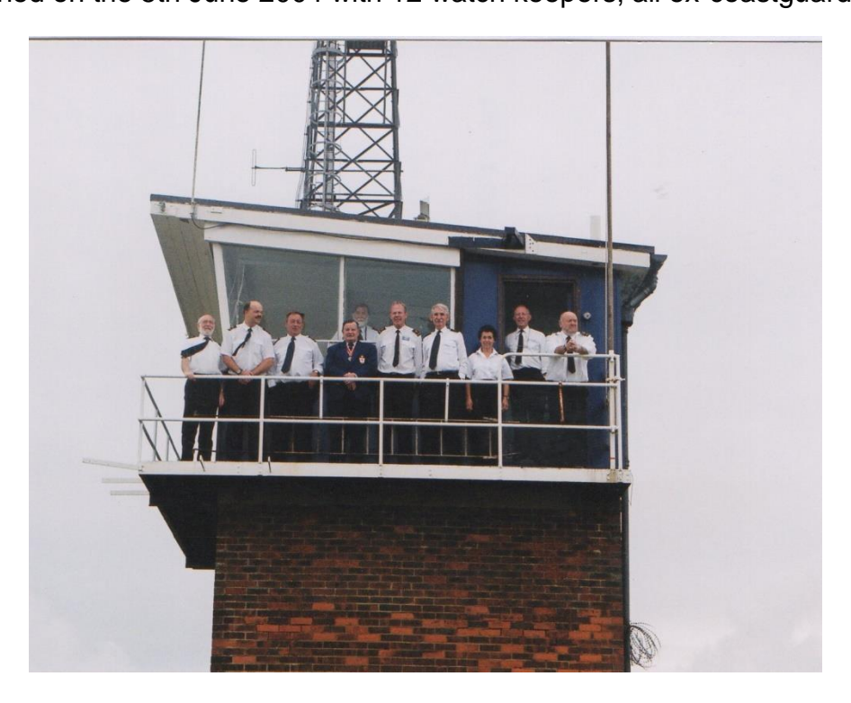
A photo taken just after the original opening

The station opened on the 5th June 2004 with 12 watch keepers, all ex-coastguard officers.