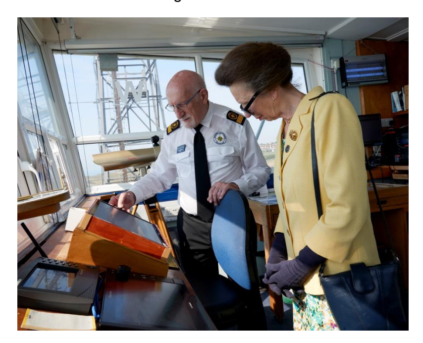
In September 2020 NCI Newhaven received a visit from our Royal Patron, HRH The Princess Royal to help us celebrate our pandemic-delayed 15<sup>th</sup> anniversary.

Over the years numerous items of equipment have been purchased including radios, radar, AIS*, CCTV, aerials and various visual aids along with IT backup equipment. All thanks to numerous grants, gifts and the efforts of our fundraising teams.