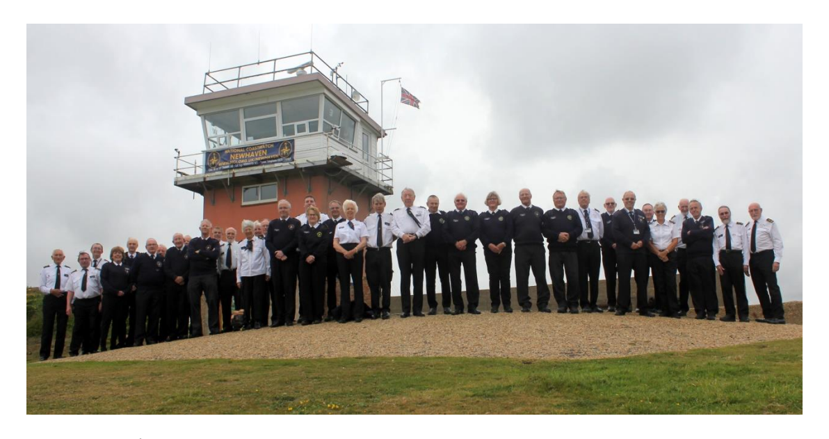
NCI Newhaven 15<sup>th</sup> anniversary photo taken with the station surrounded by scaffolding, and a temporary sign, during replacement of the balcony in 2019

Major works to the building over the 16 years have included a new external staircase to replace the 3 vertical ladders, extensive repairs to the external facade of the building, a new roof, new windows, safety railings on the roof, a replacement balcony and a general refurbishment of the interior including a rewire of electrics and communications. The observation room layout was modified with new furniture to house the various items of equipment along with the chart table. Labour costs for these projects were kept to a minimum through the hard work and time of a few volunteers.